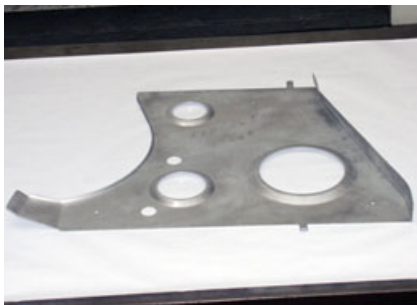
Correcting and adjusting of a pressed part of the fuselage section of an Airbus A340

The operators work step by step, check the part in between with the template, and continue until the part fits perfectly to the template. Machine operators need some basic training with the machine and the different tools. Because they are usually very familiar with the behaviour of sheet metal, they become after a short time very efficient users of the machines and tools which then results in a significant increase of productivity in the workshop.