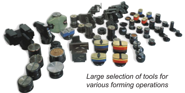
Large selection of tools for various forming operations

Tool change is done in seconds which makes the use of the machine highly flexible. Machines and tools are designed to reach their maximum capacities without special effort and to do quick and efficient forming of profiles and other sorts of sheet metal.