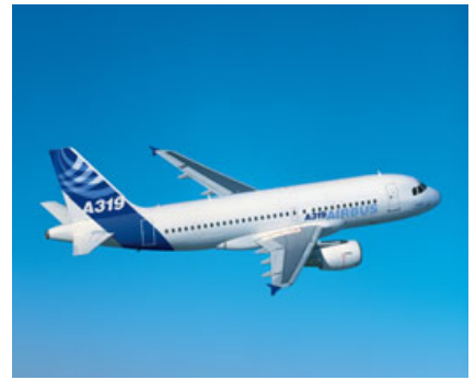
Airbus 319 (Copyright by Airbus S.A.S.)

Generations of aircrafts have been produced with the help of Eckold shrinking and stretching machines, in the civil sector as well as in the military field (examples: A400M, Eurofighter). As well in helicopter manufacturing (for example EUROCOPTER), space flight and space travel (for example HERMES space plane, or the European Ariane carrier rocket), aircraft maintenance and repair shops, shrinking and stretching is used. The main task of the Kraffformer machines is to do correcting and adjusting of pressed parts. This means to correct the shape and dimensions of the part, to remove buckles or dents. For instance, this is being used for manufacturing of all the types of Airbus aircrafts in the factories of EADS in Germany, France and Great Britain as well in numerous parts supplying companies to Airbus.