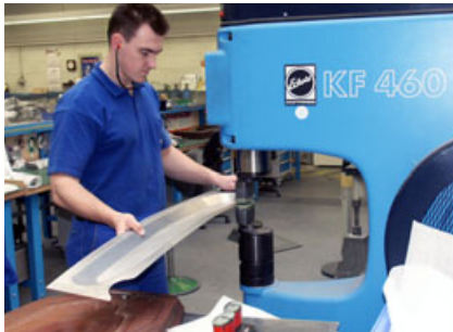
Correcting Job with Eckold forming machine KF460 of a lower covering part of of the floor section for the Airbus A380