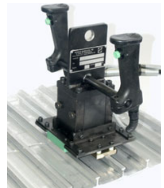
Correction of forward panels with special RIG-016 tool

Knowing that Eckold is the specialist for sheet metal forming, the German aircraft industry has approached them several times with some special problems to solve. For example Eckold created efficient special tools for correcting and adjusting of forward panels of the wings, which are being milled before from the solid.