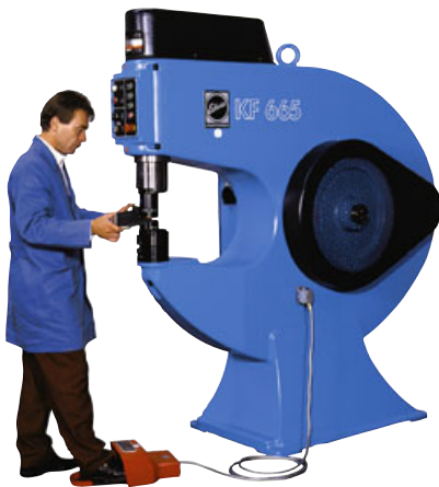
Largest type of Eckold forming machine, KF665 with 675 mm horizontal space

Today there is a full range of machines in different sizes called Kraftformer, having different throat depth and forming capacity. Maximum horizontal throat depth is 675 mm and a forming capacity of 6 mm thick steel, and 7 mm of aluminium, reached with the largest machine KF665. This machine offers a large working area and allows to produce larger pieces too.