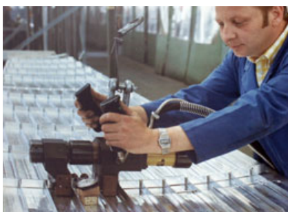
Partial shrinking of wings for Dornier Do 228

Knowing that Eckold is the specialist for sheet metal forming, the German aircraft industry has approached them several times with some special problems to solve. For example Eckold created efficient special tools for correcting and adjusting of forward panels of the wings, which are being milled before from the solid.