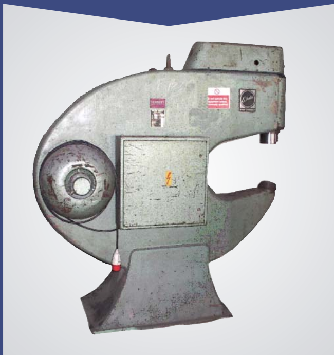
Kraftformer by rebuy